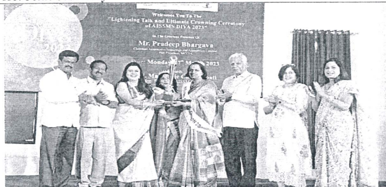
Women's Day Celebration Teaching staff of AISSMS CHMCT