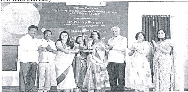
Women's Day Celebration Teaching staff of AISSMS CHMCT