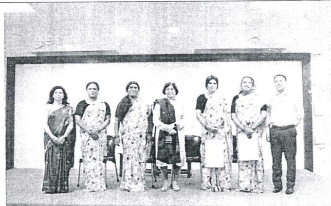
NSS Activity on Gender Equality in the form of act under the theme of KUROOP